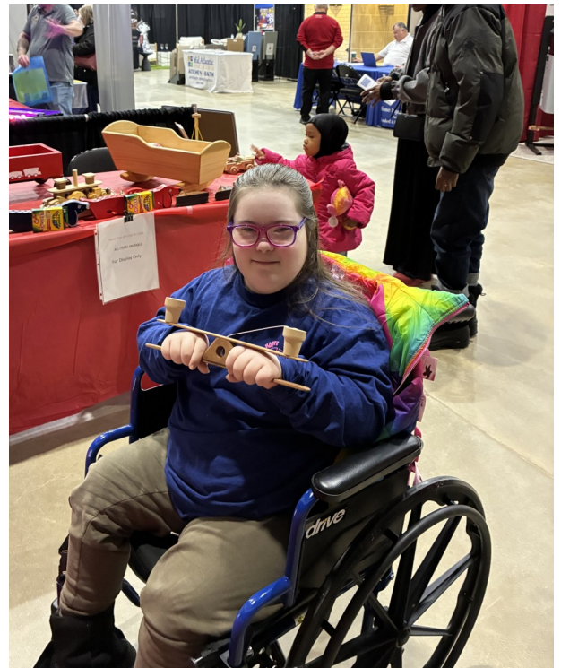
A happy new flip toy owner!